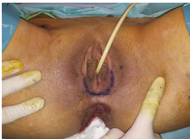
Fig. 1. Preoperative photograph. Preoperative marking a U-shaped incision in the vulva.

When treating patients with MRKH syndrome, the primary goal is the creation of a functional neovagina that enables satisfactory sexual intercourse, thereby improving overall quality of life [7]. An ideal reconstruction should provide adequate dimensions, a physiological mucosal lining, and satisfying sexual function, along with minimal morbidity at the donor site [6]. Vaginoplasty using acellular dermal matrix presents many advantages when compared to the use of an autologous graft, such as the avoidance of scars and morbidity at the donor site, a