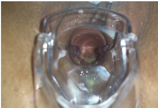
Fig. 4. Four years after the operation. The neovagina was well reconstructed with a soft, pliable, and easily extended mucosa lining.

shorter time for epithelization, the simplicity of the surgical technique, and also nearly normal sexual function outcomes [7].