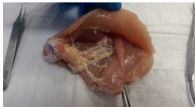
Fig. 3. Prepared chicken thigh with exposed femoral artery. Chickens used in the experiment were purchased at a mart.