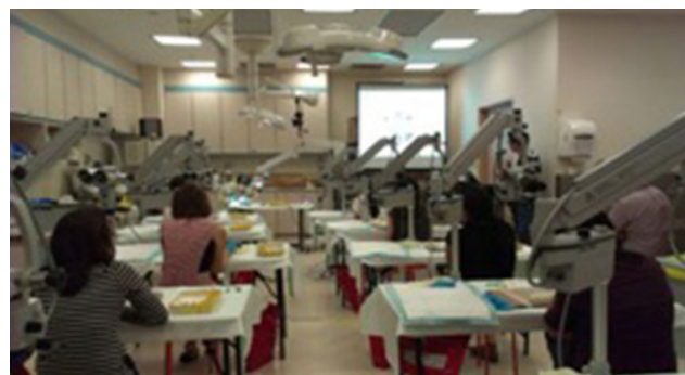
Fig. 2. The course set-up. An image of the arrangement of the tables and microscopes in the course.

Immediately after each course, each participant was given a