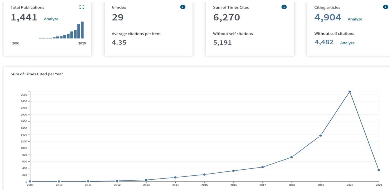
Figure 2: Publication Distribution for WOS