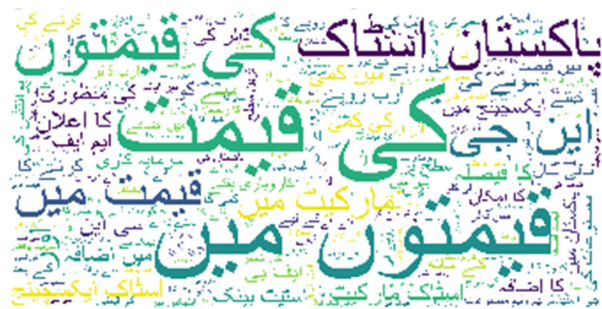
Figure 2: Word cloud representing important tags from headings of Urdu news from Business & Economics category

“Python Arabic Reshaper” [19] is a project to reconstruct Arabic sentences so that they can be used in applications that don't support Arabic script. The code from this project was used to transform Urdu news headline in order to construct word clouds in Urdu language.