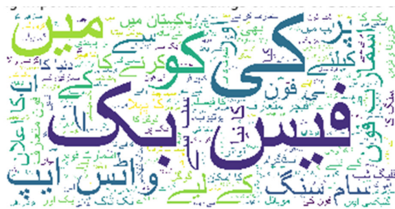
Figure 4: Word cloud representing important tags from headings of Urdu news from Science & Technology category