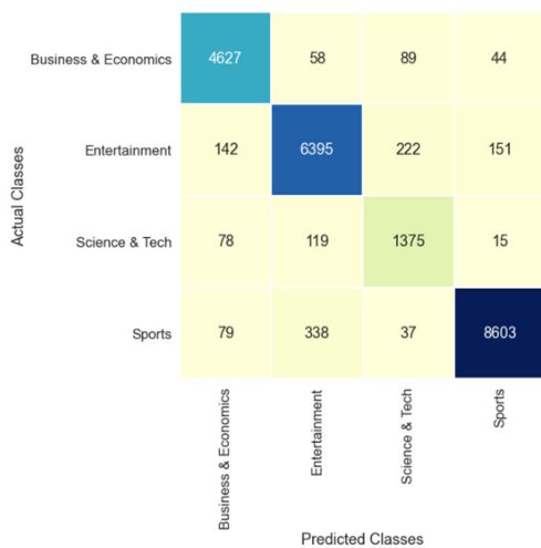
Figure 6: Confusion matrix for Bernoulli Naive Bayes Classifier

Both Bernoulli Naïve Bayes and multinomial Naïve Bayes algorithms are proven to be good in NLP-related tasks therefore both of them were used in Urdu news classification task. Sklearn’s MultinomialNB and BernoulliNB are implementations of Naive Bayes that are built with NLP-related tasks in mind.