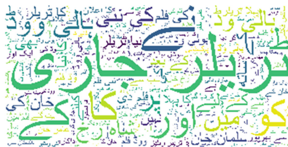
Figure 3: Word cloud representing important tags from headings of Urdu news from Entertainment category