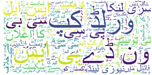
Figure 5: Word cloud representing important tags from headings of Urdu news from Sports category

In order to further understand the dataset, top 5 unigrams and bigrams were discovered using chi square. Table 1, 2, 3 and 4 represents the top 5 unigrams and bigrams for each of four categories.