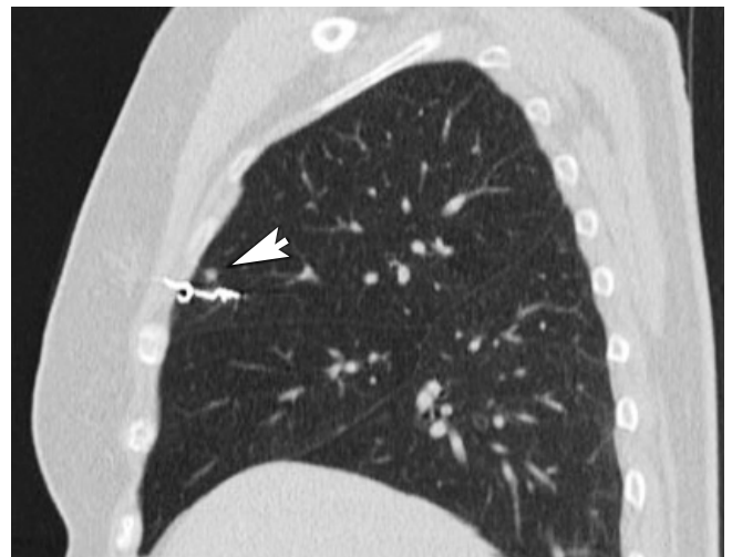
Fig. 4. A 56-year-old female patient with a 0.4-cm solid nodule in the right upper lobe underwent CT-guided microcoil localization before video-assisted thoracoscopic surgery. Immediate frozen-resection histopathology revealed a reactive lymph node. Post-marking sagittal reconstruction CT revealed that the intrapulmonary part of the microcoil was adjacent to the nodule (arrow), and the proximal end of the microcoil was located within the chest wall.

All 501 nodules were marked with microcoils. A total of 526 microcoils were used, of which 25 nodules used two microcoils. The reason for implanting the second microcoil was that the position of the first microcoil was unsatisfactory on post-marking CT. In 65 out of the 501 nodules, the distal end of the microcoil was inserted in the nodule (Fig. 1A), and the remaining microcoils were placed within 1.0 cm of the nodule (Figs. 3, 4). The proximal