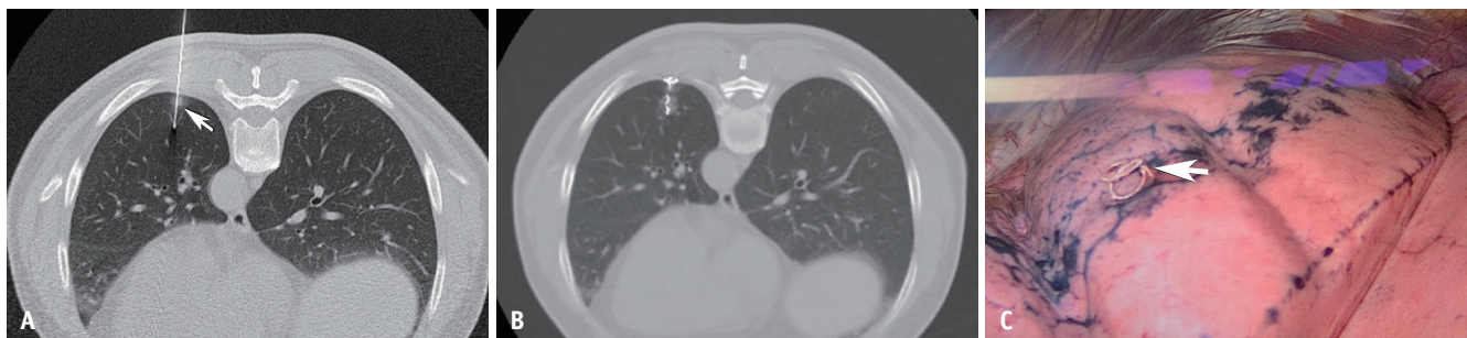
Fig. 1. A 63-year-old male patient with a 0.9-cm ground-glass nodule in the left lower lobe underwent CT-guided microcoil localization followed by VATS. Immediate frozen-resection histopathology revealed inflammatory lesions. A. Needle passes through the lesion (arrow). B. The proximal end of the microcoil is located within the chest wall with minor bleeding in the lung parenchyma around the microcoil. C. The proximal end of the microcoil (arrow) is visibly exposed outside the pleura during VATS. VATS = video-assisted thoracoscopic surgery

VATS was performed under the guidance of implanted microcoils without the aid of intraoperative fluoroscopy. The patient was placed in the lateral position with the affected side facing up and ventilated with a double-lumen endotracheal tube while under general anesthesia.