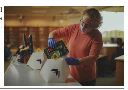
*Source: Baek Yeon-sik, 2016. Lee Seong-cheol, 2019 https://www.netmanias.com/ko/post/operator_news/8456; http://www.klive.co.kr/; Shin Dong-hyung. 2019; https://www.mk.co.kr/news/it/view/2020/05/546571/, https://www.nytimes.com/2020/06/17/us/google-wing-drones-virginia-books.html

The main expected effect that can be derived from the following examples is that services can be provided in a variety of ways for users who are difficult to make a visit. As such, unmanned book delivery service seems to be within the direction of library application. If remote control technology, artificial intelligence, drone technology and autonomous driving technology are used, book delivery service through unmanned vehicle control is likely to be available. In fact, as mentioned in <Table 10>, Wing's drone service has been used to provide library's drone-based book lending service for the first time to teenagers in the Montgomery County School District, Maryland. After receiving students' orders for books through Google Form, librarians at local libraries search for the books and prepare them by hanging the books on a string lowered to the ground by drones. Then, the drones go to the Wing's drone launch facility to deliver the books and pull back the string to terminate the delivery service