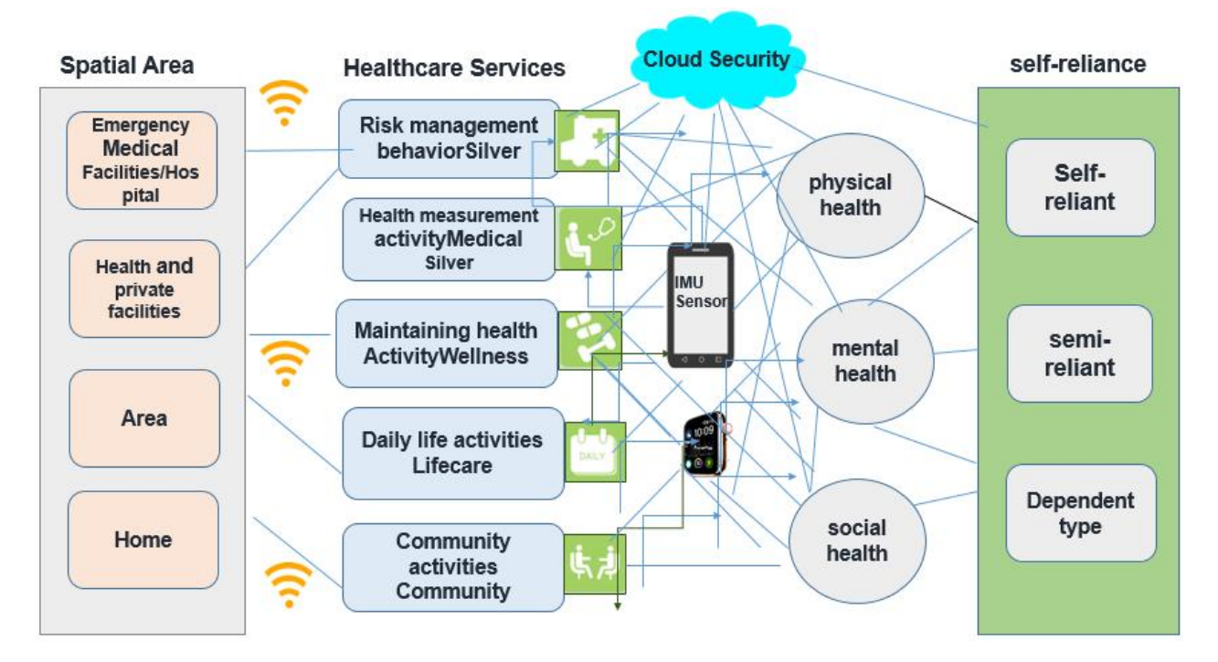
Figure 4. NNSCS model for elderly health support elements