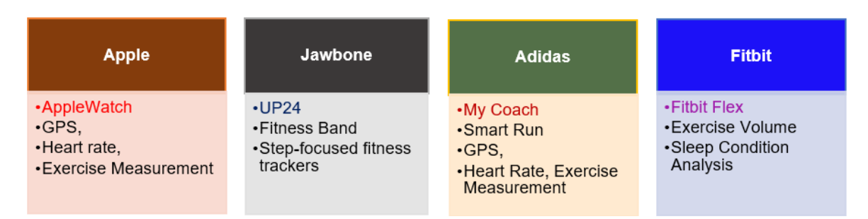
Figure 1. Personal international device products

ICT companies that commercialize new concepts of medical care by combining the cutting-edge technology trends with healthcare are notable. Figure 1 shows major international device products that provide services with personal health care devices combining existing wearable devices and smart technologies.