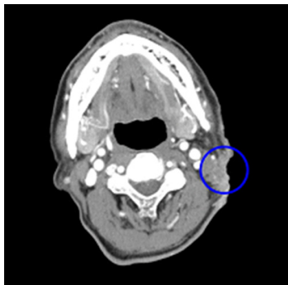
Fig. 1. Preoperative enhanced computed tomography finding. A 5 cm mass on the left lateral neck, and skin thickening with central ulceration is seen (blue circle).

The incision was marked with a safety margin of 5 mm from the visible tumor on the inferior, posterior, and superior portions of the lesion, and a 10 mm safety margin on the mandibular margin and anterior neck (Fig. 2). The anterior incision was