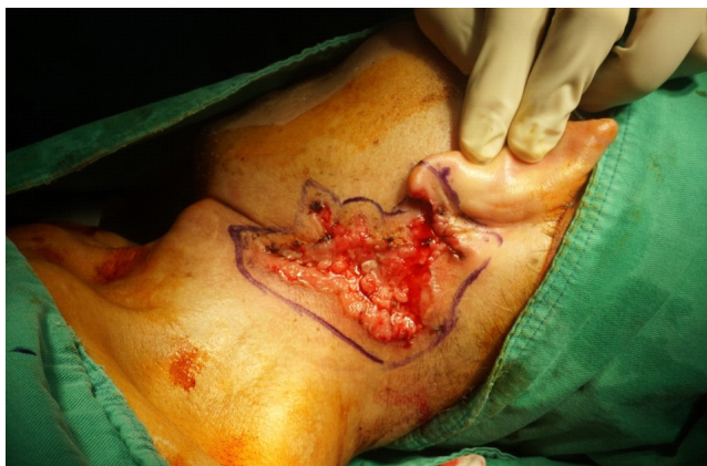
Fig. 2. Preoperative photograph. The preoperative ulcerated wound was covered with an infected pseudomembrane and multiple small nodules. The incision design was marked with a safety margin of 5 mm from the visible tumor on the inferior, posterior, and superior portions of the lesion, and a safety margin of 10 mm on the mandibular margin and anterior neck.

deep and included the superficial musculoaponeurotic system on the posterior portion of the mandibular ramus and the platysma muscle on the anterior neck. Other incisions were made deep into the fascia. When the tissue including the tumor was elevated from the underlying tissue, the tumor was found to have invaded the superficial lobe of the parotid gland. Consequently, partial parotidectomy was performed without injuring