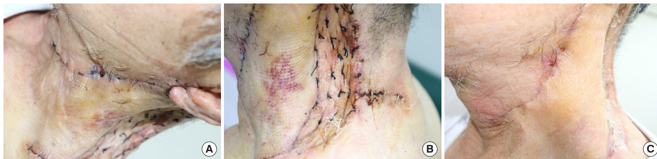
Fig. 4. Postoperative photographs. Seven days after flap transfer and skin graft: (A) the flap survived well and (B) the skin graft was well taken. (C) At postoperative day 21, the wounds were healed and the skin flap covered the mandibular margin and the lateral neck except for the narrow area showing the vertical skin graft.

the facial nerve. The tumor had also invaded the fascia of the SCM muscle and therefore the invaded fascia and some part of the SCM muscle were excised.