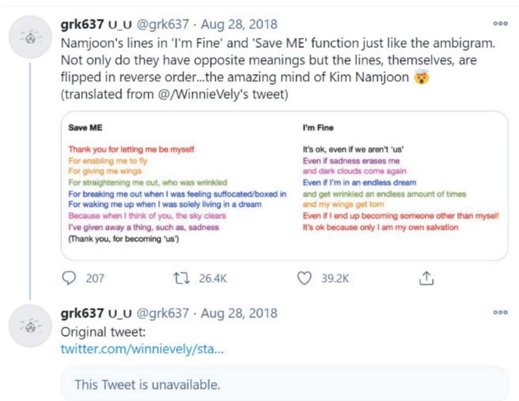
<Figure 8> Chiasmic structure of “Save Me” and “I’m Fine” (grk637, 2018)

“I’m Fine” completes a quest for healing begun with “Save Me,” as a love song to the self, acknowledging, that even with our imperfections, we are our own salvation. The chiasmic structure of these two songs, like the associated ambigram (Figures 8 & 9) reinforces their intertextual