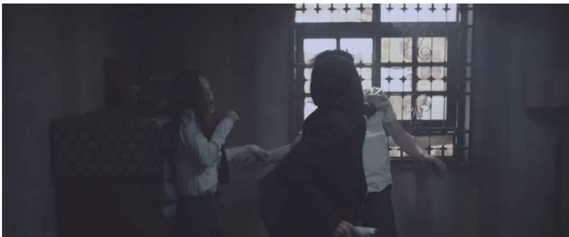
<Figure 7> Image of Domestic Abuse and Trauma in BTS. (2015a). "I NEED U" Official MV.

music video later," reminding ARMY that "This song is a prize that I'm giving to you" (Pdogg et al., 2017c). Recognition of a power imbalance in a relationship and a desire to equalize and mitigate its impact is a mature and mentally healthy approach, modeling healthy behavior and mutual respect. BTS recognize themselves as the object of affection and choose not to demand ARMYs' loss of self as part of the relationship dynamic. Just as they have recognized the need for self-love and healthy boundaries, they remind ARMY to do the same.