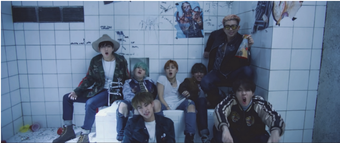
<Figure 2> Image of Friendship in BTS. (2015b). "Run" Official MV.

reach audiences and markets regardless of native language or culture.