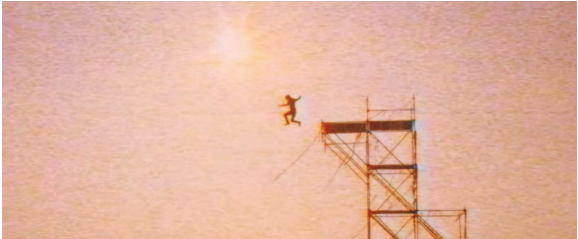
<Figure 6> Image of Suicide/Self-Harm in BTS. (2015b). “Run” Official MV.