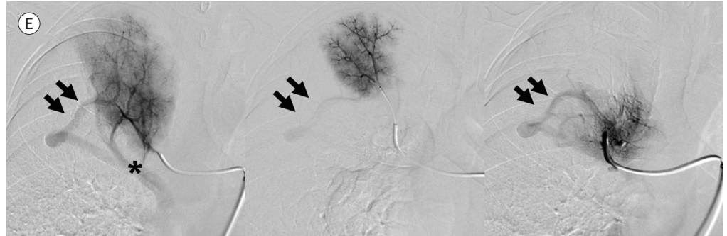
Table 1. Diagnostic Findings of Isolated MPV, Scimitar Syndrome, and Pulmonary AVM

E. Pulmonary selective arteriography in several segmental arteries show normal parenchymal staining and normal venous drainage into the right superior pulmonary vein (asterisk) through the tortuous vein (arrows) in the right upper lobe.