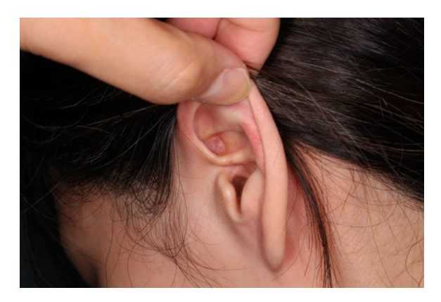
Fig. 3. Clinical photograph taken on postoperative day 14 showing a viable skin flap with an acceptable aesthetic outcome. of the mass indicated that it originated from the auric-

cells with nuclear palisading and Verocay bodies (Fig. 5A). Immunostaining was positive for anti-S100 protein and negative for alpha-smooth muscle actin (Fig. 5B). The final diagnosis was schwannoma. The gross anatomical location