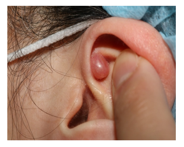
Fig. 1. Preoperative examination showing a 1-cm pedunculated mass in the superior conchae.

Gross examination revealed a 10 \times 8 -mm well-encapsulated oval mass with a smooth surface (Fig. 4). The pathology report noted an Antoni A area composed of spindle