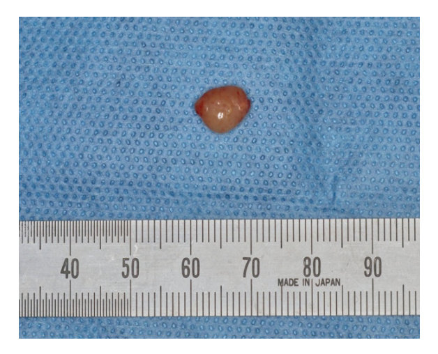
Fig. 4. Gross morphological examination showing a well-demarcated tumor measuring 10 \times 8 mm with a smooth surface.