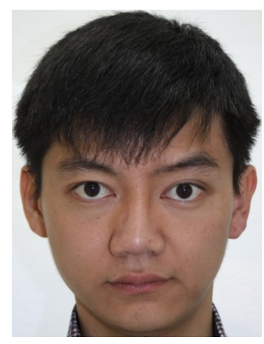
Fig. 6. Postoperative photograph 1 year and 5 months postoperatively. No recurrence and good aesthetic results.