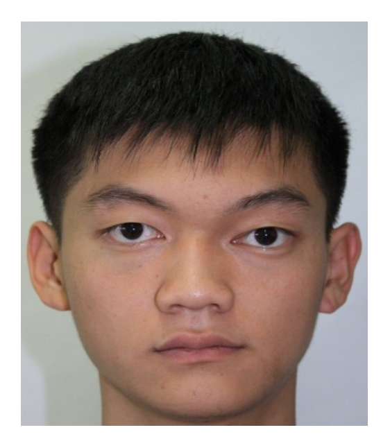
Fig. 1. Preoperative photograph. Vertical orbital dystopia is observed.