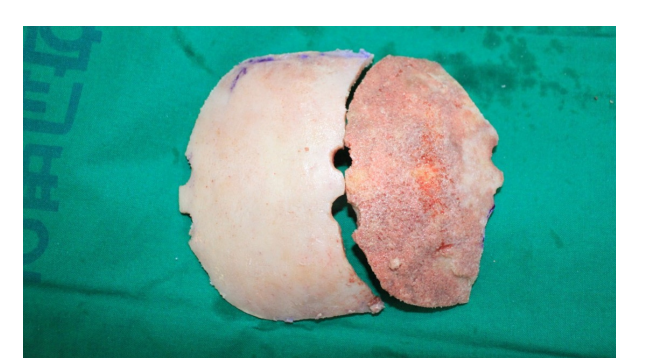
Fig. 4. Intraoperative photograph. The harvested frontal bone was split and reassembled for reconstruction at the defect site.

were found to maintain their symmetric contours (Fig. 5A, 5B, 5C). No specific complications such as vision problems, facial nerve disorders, and infections were observed in the patient. He has now been postoperatively followed up for 1 year and 5 months and has not experienced any recurrence. A clinical examination revealed a reduction in the downward displacement of the left eye from 5 mm to 1 mm and a reduction in lateral displacement from 2 mm to 0.5 mm. Exophthalmos also improved from 3 mm to 0.5 mm. The patient was satisfied with the functional and aesthetic