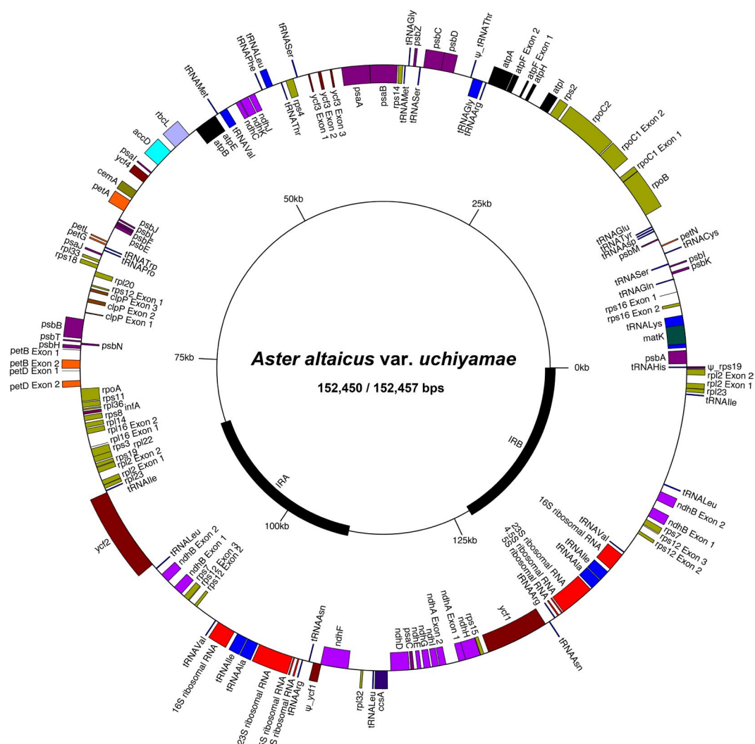
Fig. 1. Plastid genomic map of Aster altaicus var. uchiyamae .