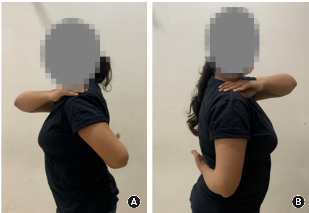
Fig. 4. Internal rotation exercises with the patient standing. (A) He/she places one hand over the opposite shoulder and the other hand behind their back. (B) Then, he/she changes the hands and performs the same action with the other hands on the opposite side.

physiotherapist and via face-to-face consultation with the physician once every 3 to 4 months or as was feasible in the lockdown situation.