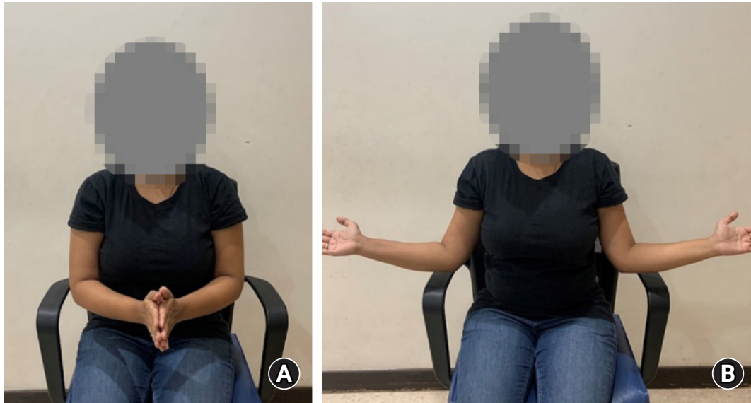
Fig. 3. External rotation of the arm with the elbow adducted (ER1) exercises with the patient sitting on a chair. (A) The patient joins their hands in the center. (B) Then, he/she takes their hands out by externally rotating their arms.