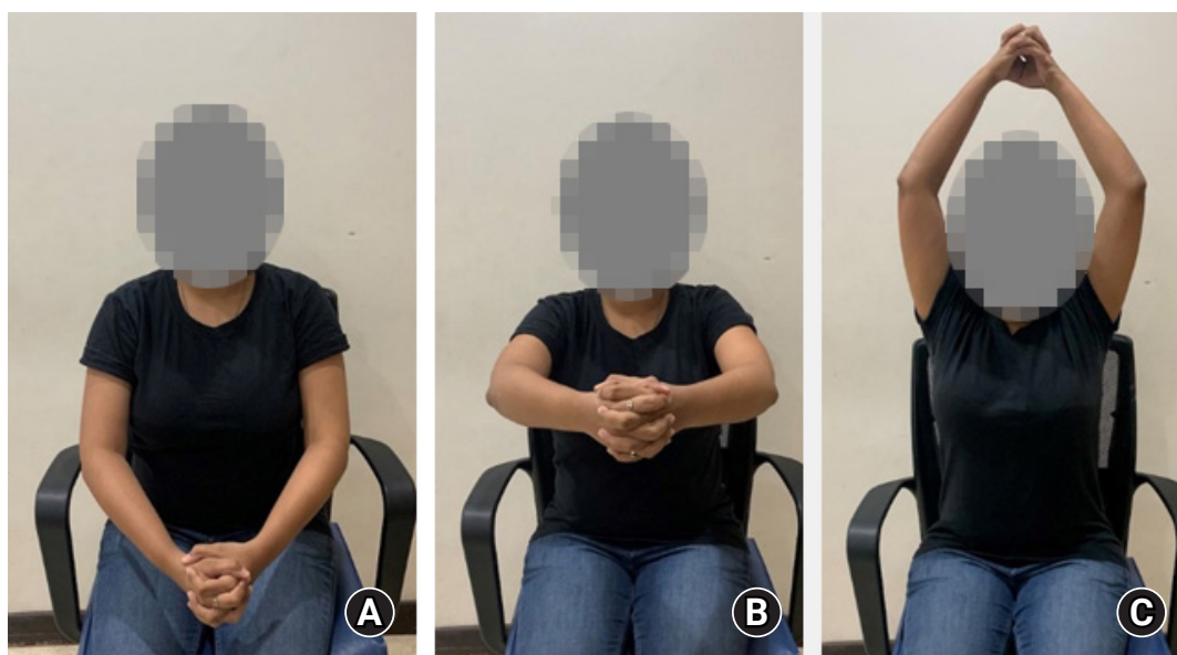
Fig. 1. Self-assisted elevation exercises with the patient sitting on a chair. (A) He/she interlocks their fingers and their elbows are flexed at 20°–30°, at rest the arms are internally rotated. (B) He/she slowly elevates both arms together in a controlled fashion. (C) He/she then fully elevates their arms together on top of the head, and in doing so the arms get externally rotated.

were asked to sit on a chair at a distance of 6 feet from the mobile phone or laptop device; a phone had to be held by a family member who adjusted its position to center the patient image. The patients were taught the following exercises and were asked to repeat them 10 times. All four exercises were taught sequentially. Patient compliance to the exercise regimen was ensured by supervising them via the virtual platform once every month by the