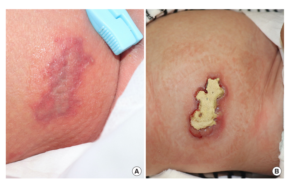
Fig. 1. Initial photographic findings of calcinosis cutis at flank area. (A) The patient had erythema in the flank area and its initial size was 5 x 2 cm. (B) The erythema became firm and changed into whitish crust consist of small crystals.

The wound size diminished day by day with marginal epithelization (Fig. 3C). There was no infection sign during the treatment. After 2 months, the defect was fully covered with healthy normal skin. There was no depression or contracture at the wound site. There was only pigmentation in the scar. The pa-