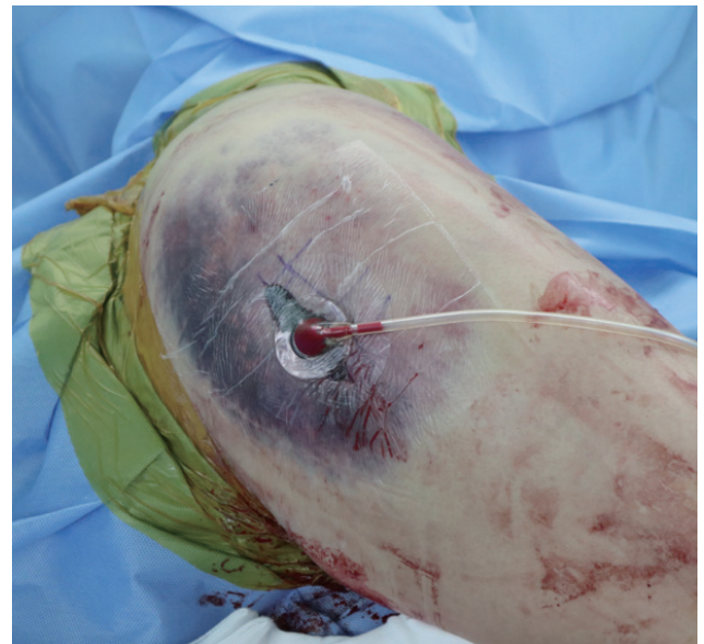
Fig. 3. After incision and drainage, negative-pressure wound therapy was applied to the incision area.