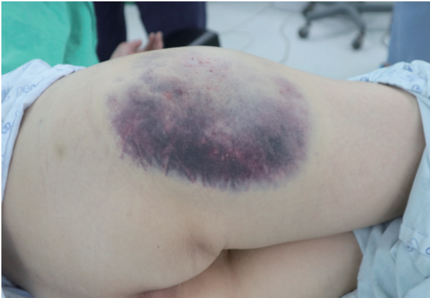
Fig. 1. A bluish color change on the right buttock measuring 25×15 cm.