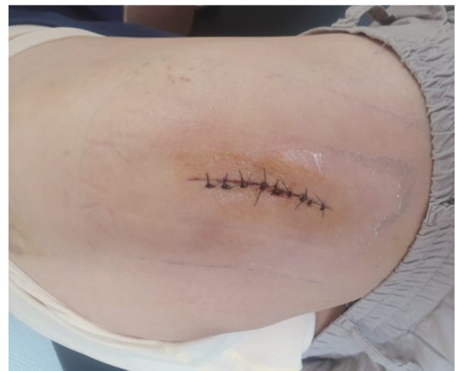
Fig. 5. Two weeks after the operation, the previous skin color had improved.

An acute Morel-Lavallée lesion can be treated conservatively with only simple compression in cases of small fluid collections; however, infection is common in cases of large fluid collections, and necrosis of the skin degloved from the fascia is also common [4]. There is no clearly established treatment algorithm. Seo et al. [5] and Kumar et al. [6] suggested the quilting technique for fixing degloved subcutaneous tissue to the fascia layer, and Alexandris et al. [7] proposed using hip gradient compression socks to