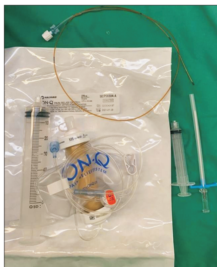
Fig. 1. The components of On-Q system (indwelling catheter and elastic pump, Halyard Health, Alpharetta, GA).

We collected data regarding pain intensity, as assessed before the operation, upon returning to the recovery room (H0), and at postoperative 12 hours, 24 hours, 48 hours, and 1 week, using a VAS score from 0 (no pain) to 10 (worst pain). We assessed the pain intensity at the abdominal and posterior lumbar surgical sites separately, at rest and during movement (coughing, turning, or walking). The sleep