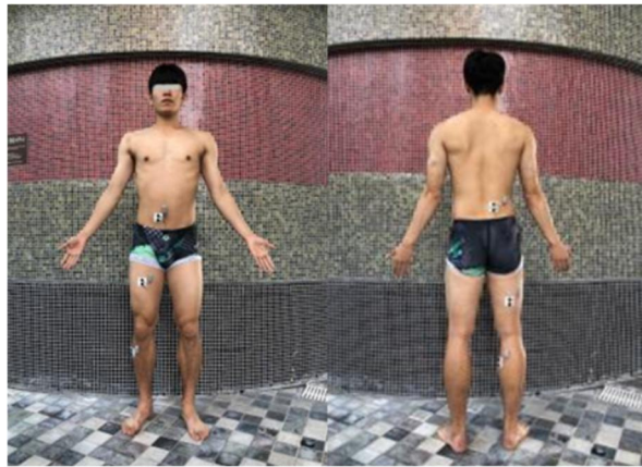
Figure 2. Surface electrode attachment site

In order to standardize the action potential of each muscle, muscle activity was measured during maximum isometric contraction in muscle manual test posture. After collecting data for 5 seconds, the average EMG signal amount for 3 seconds except for the first and last seconds was used as %MVIC. After collecting data for 5 seconds, the average EMG signal amount for 3 seconds except for the first and last seconds was used as %MVIC. The measured data were extracted to observe the muscle activity in the raw data measured during exercise. The data were collected with 1,000 Hz signals per second, and the frequency range was set to 0-1,000 Hz, and then the input signal was amplified and converted into digital signals. For the comparison within the same subjects, the EMG signal average value of the target subjects was converted into maximum isometric contraction (%MVIC) integral EMG and analyzed by filtering (30Hz low pass, 350Hz high pass) and rectifying data values and converting them into RMS values.