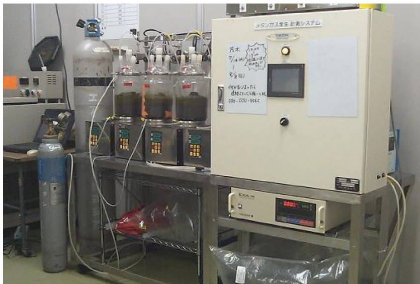
Fig. 2. In vitro continuous gas quantification system installed infrared CO 2 analyzer and infrared CH 4 analyzer [41].

GC-1024, Kyoto, Japan) equipped with an attachment of direct inlet device system.