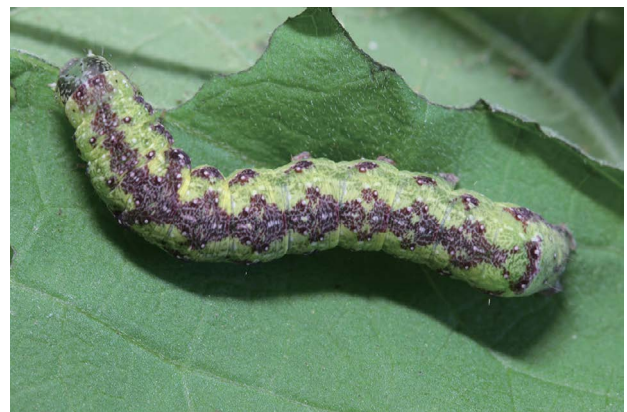
Fig. 3. Larva of Condica dolorosa in Korea.

dolorosa feeds on Carpesium abrotanoides L. (Asteraceae). In Borneo, C. dolorosa feeds on Conyza and Elephantopus (Compositae) (Holloway, 1989).