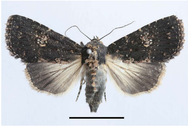
Fig. 1. Adult of Condica dolorosa in Korea. Scale bar=10 mm.

Material examined. 1 female, Korea: JN: Gurye, Temple Hwaeum, 29 Aug 2018 larvae, 20 Sep 2018 eclosion, Heo UH. NIBR specimen No. VLYVIN0000009697.