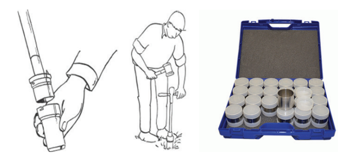
Fig 3. Core sampler for soil sampling.

Chernobyl accident, a sharp edge ring was used to collect soil by inserting it into the soil surface on the one sharp side [5]. Even in the case of the Fukushima nuclear accident, when collecting soil samples to monitor the contamination of the surrounding soil, as shown in Fig. 3, a stainless steel cylindrical core with a sharp cross-section was attached to the Core Sampler and samples of 100 mL were collected [10]. Therefore, it is expected that the core sampler shown in Fig. 3 can be selected and used as a soil sampling tool for verification of nuclear activity. This sampler can provide a suitable range of 100 ml volume samples to a depth of 5 cm; teams will use a separate stainless steel core at each sampling point to prevent cross-contamination. In addition, by attaching lids on the upper and lower parts, making it easy to seal and transport, the core can be used not only as a sample collection tool but also as a container for storing and moving samples. The core sampler, which is the main body, has a height of about 20 cm, which is considered appropriate because it involves only a slight burden to collect and move the sample.