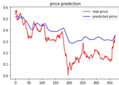
Fig. 2. Prediction Result for EBIX Stock

Window size is 20 which means weekly prediction, and 70% of data set is training set. The rest of 30% data set is testing set. After these settings, the result shows in Figure 2. The red line is real price which is historical data, and the blue line is prediction graph.