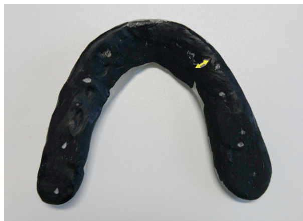
Fig. 1. Occlusal facets present on the appliance. After 2 weeks, the surface texture was assessed, and the lengths of the facets formed by the mandibular canines were measured.

was selected because it combines sufficient strength with the appropriate degree of abrasibility (for facet formation). The appliance position was adjusted with canine guidance by grinding. In addition, the appliance contacted all the teeth equally on the centric occlusion. The appliance was adjusted repeatedly over several days until the subject ceased to experience any discomfort. After the adjustment was complete, a marker (Facet Resin Marker, GC Corporation) was applied to allow for easy observation of the surface texture of the appliance. After 2 weeks, the surface texture was assessed and the lengths of the facets formed by the mandibular canines were measured. Fig. 1 shows the length of the facets.