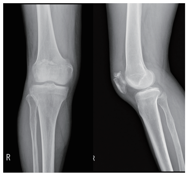
Fig. 3. At 3 months after surgery, an X-ray examination showed bone union progression without displacement of the bone fragment.

Under spinal anesthesia and supine position, a tourniquet was applied at the proximal thigh. A longitudinal incision was made along the anterior midline to expose the patella and a hematoma was removed at the fracture site, with care taken to avoid soft tissue injuries. The fragments were comminuted and displaced to the proximal side, being attached to the quadriceps. We decided that conventional tension-band wiring would not be appropriate for maintaining reduction. Therefore, we planned to repair the quadriceps and to perform reduction using the patellar bone tunnel. After identifying the location of the fragment, we performed 4-strand double Krackow locking sutures with Ethibond #5 on the quadriceps. Then, we used a 2.5-mm drill bit to make three vertical transosseous bone tunnels in the patella. After passing two central suture limbs of the Krackow loop through the central bone tunnel, we passed the medial and lateral limbs through the medial and lateral tunnels, respectively. Then, minimizing entrapment of the soft tissue, we pulled the suture limbs under guidance of an image intensifier to reduce the fragment, maintained the anatomical reduction with reduction forceps, and made ties under the patella (Fig. 2). After the retinacular tears were repaired using #1 Vicryl sutures, we used the image intensifier to confirm that there was no separation of the fragment