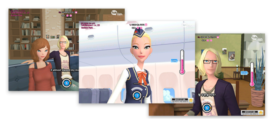
Figure 2. Screenshot of the "T" game software

SPSS 22 for descriptive statistics calculations. We used AMOS for structural equation modeling (SEM).