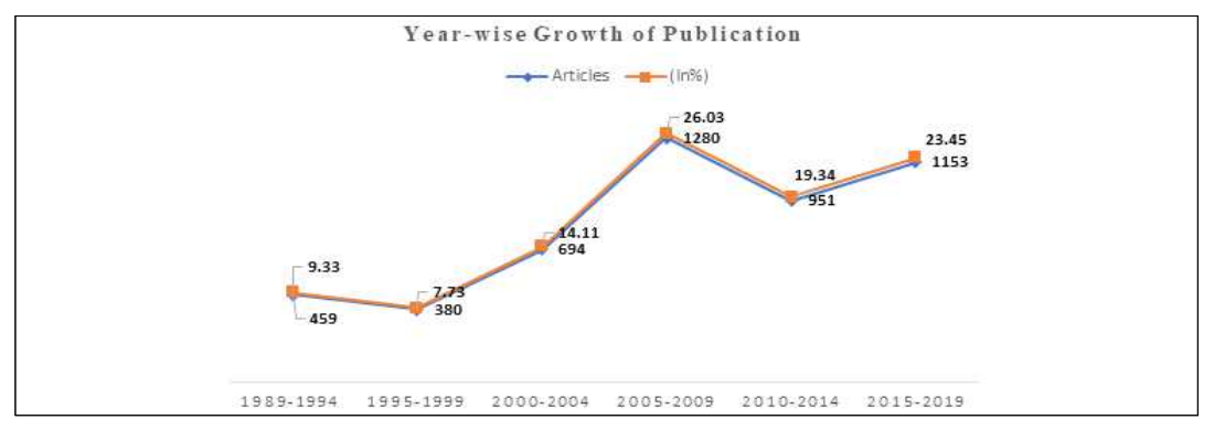
Fig. 1. Year-wise growth of publication

Fig. 1 shows the year-wise growth of research publications on Coronavirus from 1989-2019. A total of 4917 articles studied during this period showed a progressive increase in number during the tenure of 30 years. With an average of 1280 publications or 26.03% of growth, the period from 2005-2009 can be marked to have published the highest number followed by the year 2015-2019 with 1153 or 23.45% publications.