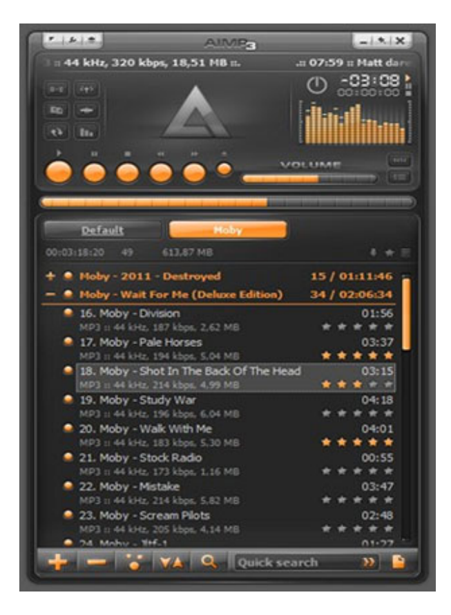
Fig. 2. AIMP3 song player

These are just the main features of the editor. Other didactic opportunities are revealed in computer programs that can be used at music lessons to develop students' cognitive interests.