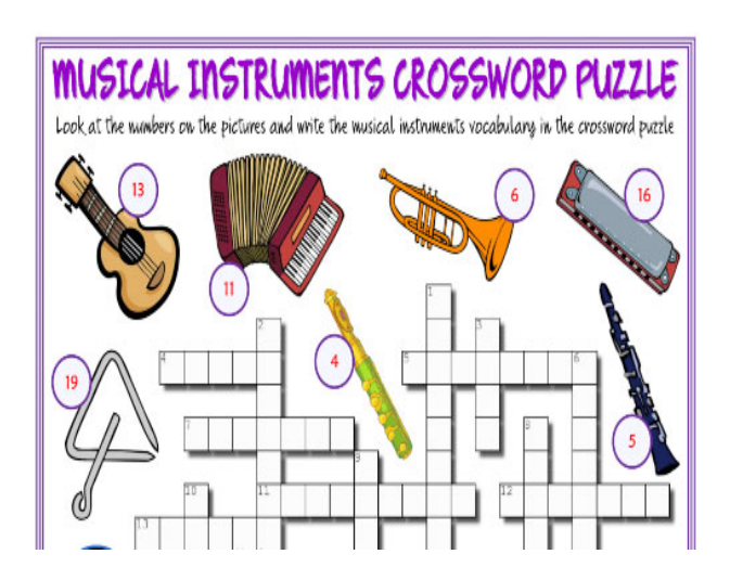
Fig. 4. Game program "Crossword"

next lesson "Music and Instruments", checking homework, each student is asked to solve a crossword puzzle on the computer, where each question is special and some even have musical fragments.