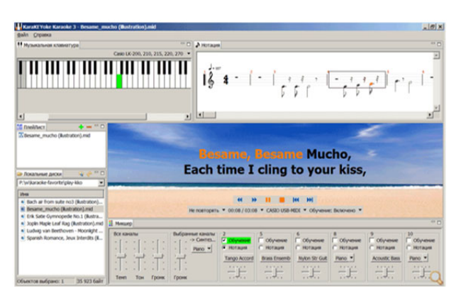
Fig. 6. Karaoke

This multimedia tool allows listening to performances of musical works (voice with accompaniment), to perform songs in karaoke mode. If necessary, the musical text of the song is displayed on the screen, which allows students to follow the "graphics" of the melody: