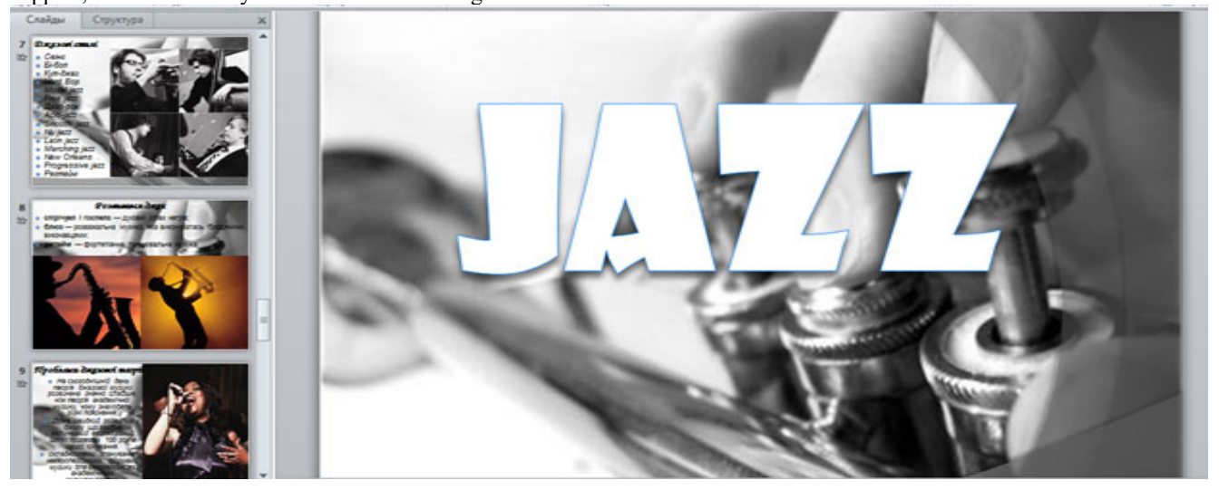
Fig. 5. Presentation "Jazz"

lesson. Electronic tools effectively replace various tables, diagrams, and cards for individual work, drawings, portraits, and more. Storage of educational materials on the school server allows providing a high level of compactness, accessibility to teachers and students, the possibility of duplication, copying and reproduction, and quick search. When studying the topic "Jazz" we used a presentation using video and audio files, as well as graphics and information on the topic.