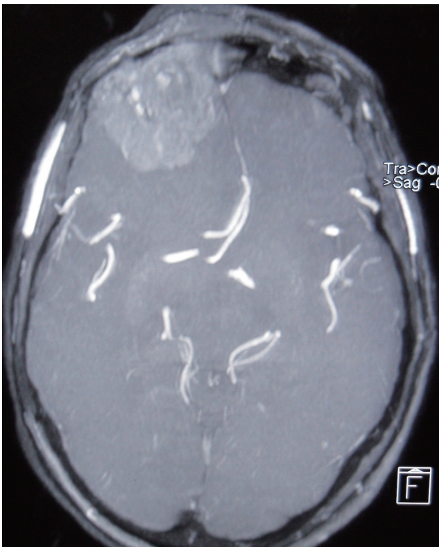
Fig. 1. Magnetic resonance imaging of the head showing an extra-axial mass.

Solitary plasmacytoma may occur at any age, but is mostly