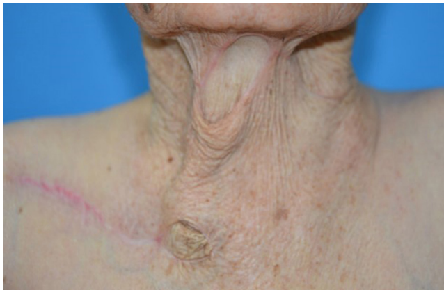
Fig. 5. One-year follow-up photograph.

covered without tension. Then the donor site was immediately sutured with minimal tension (Fig. 4). The flap remained viable without color change throughout admission (12 days postoperative). The patient was stable during the 1 year follow-up period without any complications, and was satisfied with both cosmetic and functional outcomes, reporting no limitations of cervical motion (Fig. 5).