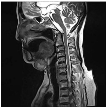
Fig. 2. T2-weighted magnetic resonance imaging revealing a 3-cm-sized, ovoid, heterogeneously enhanced mass in the submental area.

A 3-cm-sized ovoid, heterogeneously enhanced mass in the submental area was observed on both T2- and T1-weighted images with slight enhancement, located lateral to the left sternocleidomastoid muscle; several lymph nodes less than 1 cm in size also showed high signal intensity. Fine needle aspiration biopsy was performed of both the mass and lymph nodes (Fig. 2). The final diagnosis was well-differentiated squamous cell carcinoma.