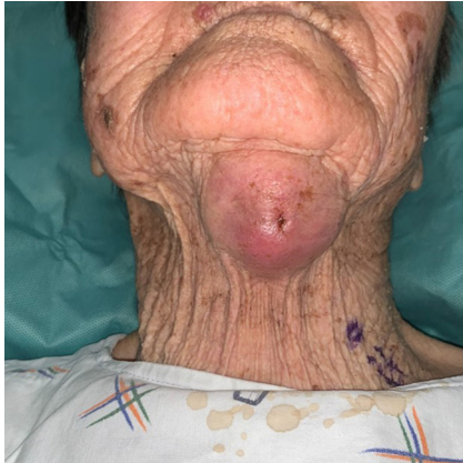
Fig. 1. An 85-year-old woman with a large mass in the submental area.