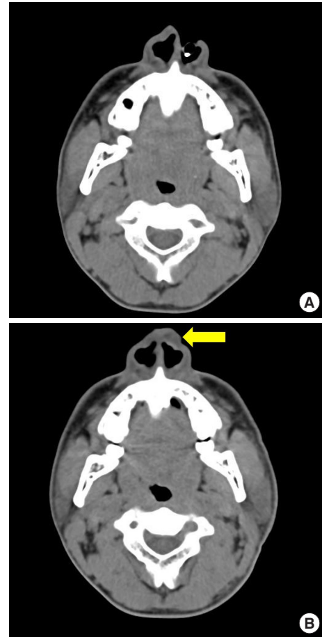
Fig. 4. Computed tomography. (A) Preoperative image. (B) Postoperative image showing the replenished nasal tip with good contour (yellow arrow).

The auricular chondrocutaneous free flap, first introduced by