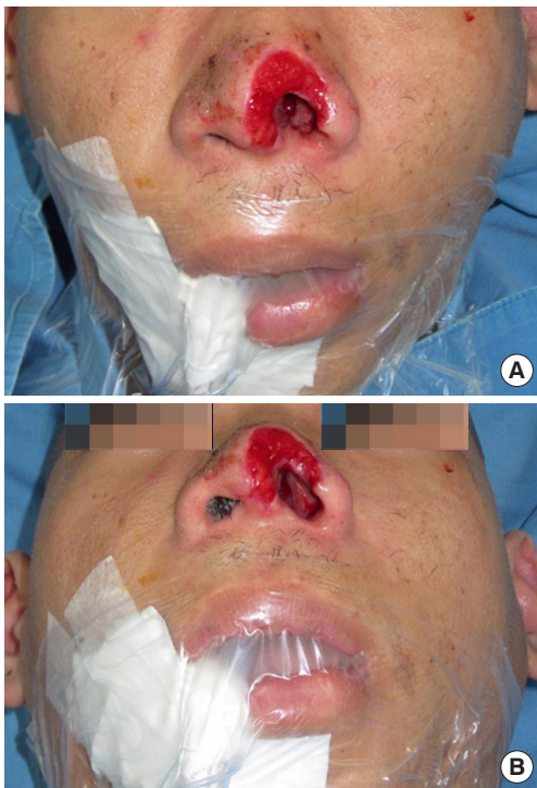
Fig. 1. A 25-year-old man with a full-thickness nasal tip defect, extending from the left nasal tip to the mid-ala, including the soft triangle. (A) Frontal view. (B) Worm's eye view.

A 25-year-old man presented with a nasal tip amputation caused by a human bite, without the amputated part (Fig. 1). The patient lived overseas, and to shorten the duration of treatment, we planned reconstruction using a single-stage full-thickness chondrocutaneous free flap based on a posterior auricular artery perforator. Reconstruction was performed after irrigation and debridement, while administering intravenous antibiotics (amoxicillin clavulanate). Dimensions of the half-moon shaped defect were 2.5 \times 2.5 \times 0.5 cm, extending from the left nasal tip to the ala. The depleted nasal lining was 0.5 \times 1 cm. After tracing of the posterior auricular artery and its branches with a handheld Doppler, the flap was designed so that conchal skin would become the nasal lining, conchal cartilage would substitute the alar cartilage and posterior auricular skin would reconstruct the external skin. The recipient vessel was a branch of the lateral nasal artery with comparable diameter, which was