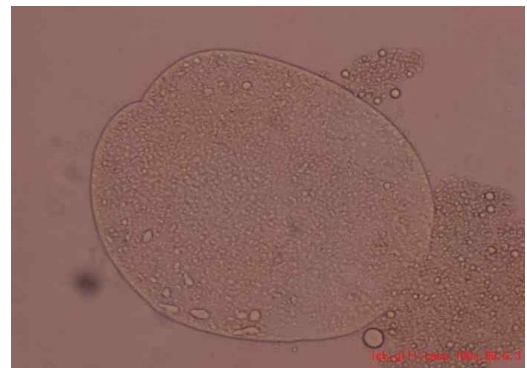
Fig. 1. Ichthyophthirius multifiliis from the gill of silver carp mag. 100x.

The absence of Trichodina sp. in the fishpond is an indication of water pollution lack and proper pool sanitary management. Trichodina sp. with an occurrence rate of 10.4%, density of 4.1, and mean abundance of 0.43 was recorded from the skin of silver carp in Bangladesh (Akhter et al. , 1997). Also, Trichodina sp. with an occurrence of 8.9%, density of 5, and mean abundance of 0.45 was detected from