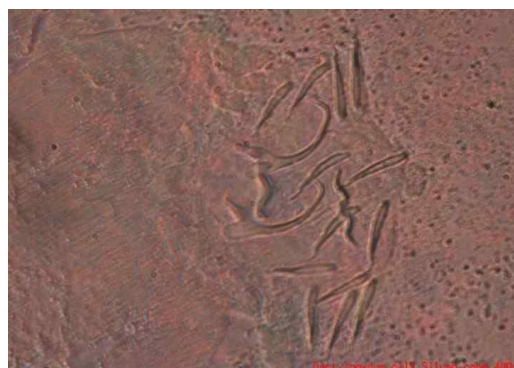
Fig. 4. D. aristichthys from the gill of silver carp mag. 400x.

2014), the occurrence of Dactylogyrus sp. in silver carp (25.3%) was very close to that of the present result, but in the case of grass carp (26.7%) was rela-