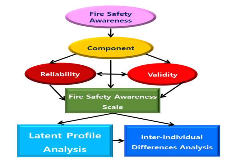
Figure 1. Research model

This study aims to analyze the latent profile of high school students' fire safety awareness using the reliable and valid fire safety awareness scale [9] and to analyze differences between latent classes according to individual differences. For this, two issues need to be considered: the type of latent profile and how to reveal the characteristics of inter-individual differences by gender, grade level, and academic achievement. Accordingly, this study was divided into latent profile analysis and individual difference analysis model. In the latent profile analysis, the classification and characterization of the latent group were used, and individual differences were analyzed separately by gender, grade and academic achievement. For analysis of latent profiles and individual differences, previous studies [10-11] were referred to. The structure of the latent profile and individual differences analysis model is shown in Figure 1.