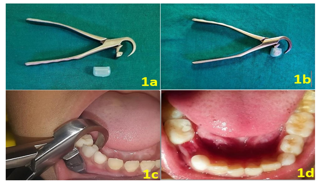
Fig. 1. (1a, 1b) Physics Forceps with a plastic bumper; (1c) extraction of tooth (84) using Physics Forceps in group 1; (1d) post-extraction site with minimal trauma in group 1.

• Retained primary teeth in the mandibular arch with at least <sup>3</sup>/<sub>4</sub> root length.