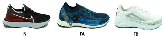
Figure 1. Control shoes (N: Nike react infinity, FA: Fila prototype A, FB: Fila prototype B)

measured by dropping a missile (Weight: 8.5 kg, diameter: 45 mm) from 50 mm above the rearfoot located at 12% in the direction from heel to toe as shown in (Figure 2) (Determan, Nevitt & Frederick, 2009; Ha et al., 2020).