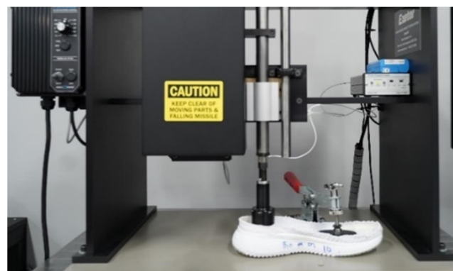
Figure 2. Impact tester (CompITS v5.0, Exeter Research, Inc., USA)