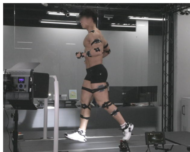
Figure 3. Experimental set-up

The participants attached 19 reflective markers (Right leg - thigh: 4, shank: 4, knee joint: 2, ankle joint: 2, shoe: 7) to each segment and joint for modeling the lower extremity after enough preparatory exercise.