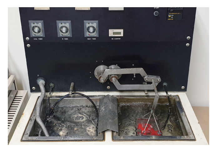
Fig. 2. Thermocycling machine. The samples were thermocycled for 5000 cycles. Thermocycling process was performed between 5 - 55^{\circ} C.

All of the cured RMGIC specimens were subjected to thermocycling process between temperature of 5.0^{\circ} C and 55.0^{\circ} C for 5000 cycles with dwelling time of 30 seconds and transfer time of 5 seconds (Fig. 2).