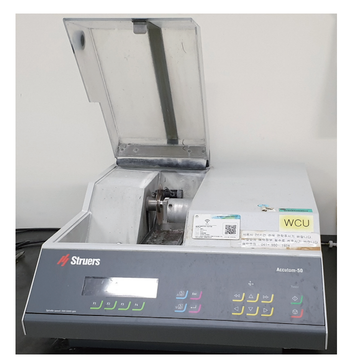
Fig. 1. Precision cut-off machine used in this study.

In group II, the surface of each specimen was air-dried for 5 seconds, and PAA was applied for 10 seconds. After washing with water for 5 seconds, the surface was air-dried for 10 seconds. Subsequently, RMGIC was applied and cured using the same method used for group I.