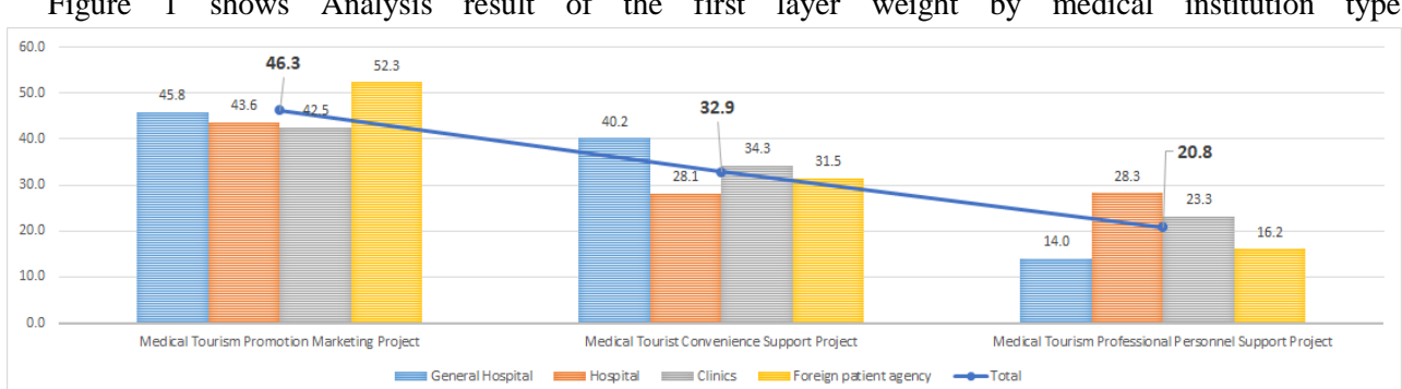
first layer weight by Figure 1 shows Analysis result of the medical institution

Medical tourism promotion marketing business' weight is high(=46.3), and medical tourism convenience support project's weight is 32.9. But Medical tourism professional manpower support project's weight is lower(=20.8).