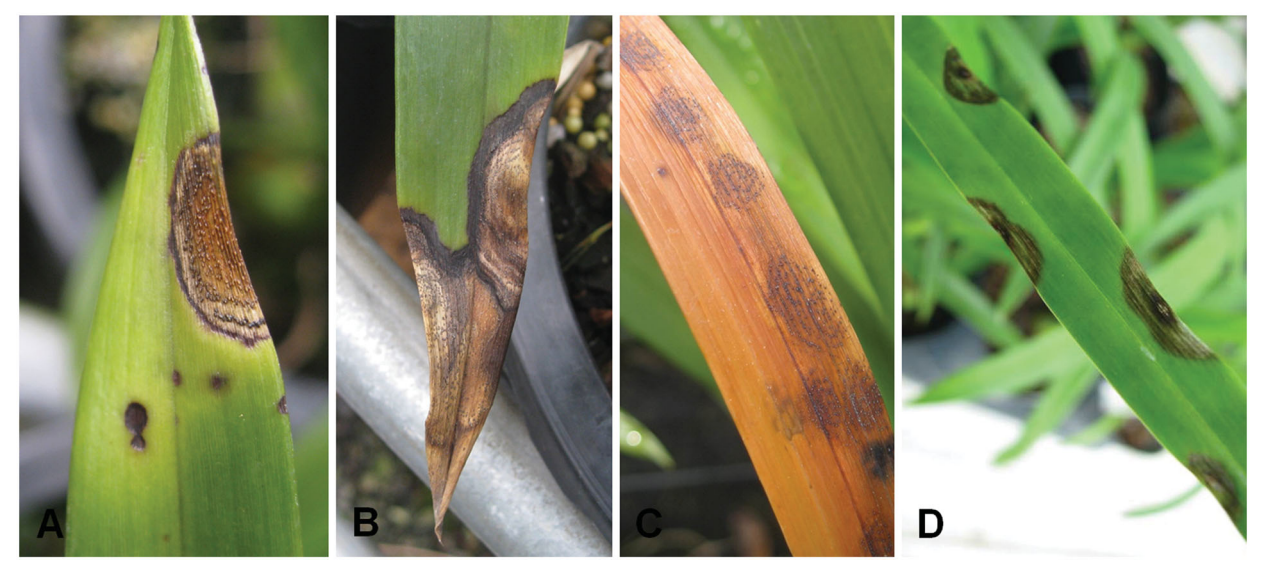
Figure 1. Symptoms of anthracnose disease occurring on Cymbidium species caused by Colletotrichum cymbidiicola . (A) Dark brown lesion developed on margin of a leaf. On the lesion, salmon-colored conidial masses formed concentrically; (B) Some lesions that coalesce to form enlarged legion; (C) Heavily Infected leaf turning completely brown and forming several concentric rings; (D) Disease symptoms appearing on young leaves of Cymbidium in pathogenicity test.

samples collected from different localities of Korea (Table 1). Morphological features of fungal structures from fresh plant materials and cultures were examined and photographed using a Zeiss AXIO Zoom V16 and AXIO Imager A2 microscopes equipped with AxioCam 506 color (Carl Zeiss, Oberkochen, Germany). Colonies on PDA were light gray with cottony aerial mycelium and reached 80 mm diameter after seven days at 25 °C (Figure 2(H)). Acervuli, sometimes rupturing the epidermis, were arranged in concentric patterns on the lesions and were cushion-shaped with simple, short, septate, and hyaline conidiophores (Figure 2(A-C, F)). Setae were brown, 2-4-septate, verruculous in the upper part, and 62.5-150 \,\mu\text{m} long (Figure 2(D)). Appressoria, produced using a slide culture technique [17], were brown, lobate, and measuring 5-15 \times 5-8.5 \,\mu\text{m} (Figure 2(E)). Conidia were hyaline, aseptate, and cylindrical, with a prominent scar, and measuring 14-16 \times 5-6 \,\mu\text{m} (Figure 2(G)). The morphological and cultural features of the causal fungus corresponded to those of Colletotrichum cymbidiicola described by Damm et al. [5].