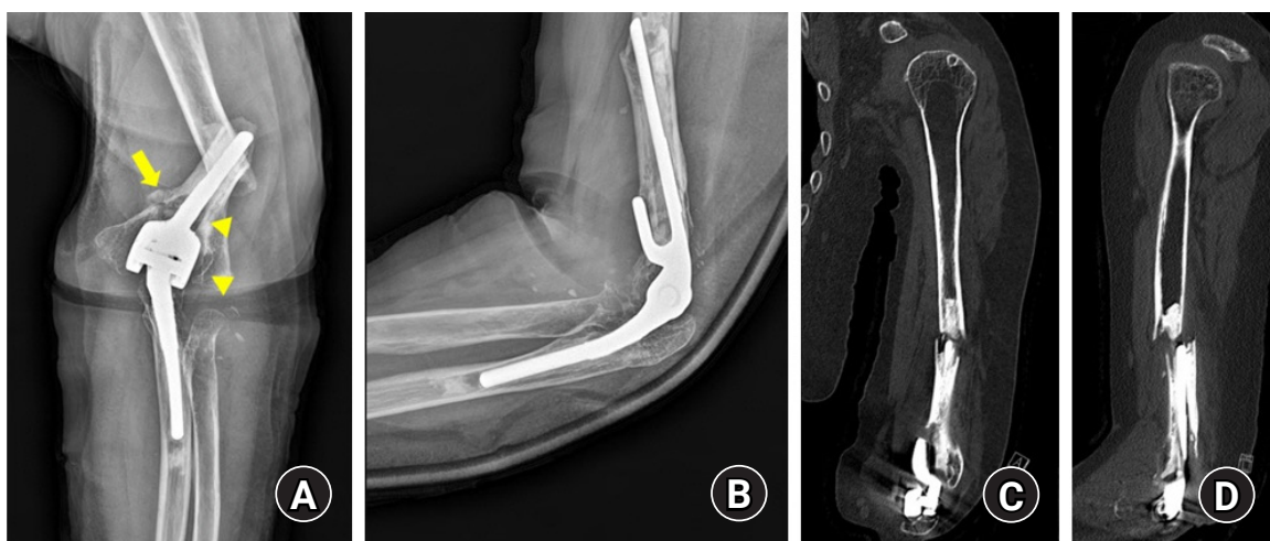
Fig. 1. Elbow anteroposterior (A) and lateral (B) radiographs, coronal (C) and sagittal (D) view of computed tomography images of total elbow arthroplasty with periprosthetic fracture. Previous fracture line are marked with arrow (A), and implant loosening areas are marked with arrowheads (A).

For the revision procedure, we used allogeneous fibula strut bone (Community Tissue Services, Kettering, OH, USA). After determining the joint line and optimum size of the humeral stem, the diameter and length of the allogeneous fibula strut bone were estimated according to the diameter and size of the bone defect and humeral stem. To resolve the difference in diameter between the humeral bone defect lesion and the allogeneous fibula strut bone, the latter was trimmed using a high-speed burr to fit the outer diameter to better enter the humeral bone defect area. In addition, the inner diameter of the allogeneous fibula