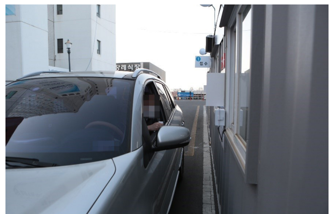
Fig. 3. A two-way microphone is used during communication between an individual and a doctor. The doctor and individual view one another through the window and talk via the microphone.

After this screening, the doctors decided whether the individual needed to be tested, whether a nasal and throat or sputum test should be performed, and whether insurance would cover the testing. The test was then prescribed, and if covered by insurance, the physician completed a document called an “infectious patient report” online and sent it to the KCDC. The doctors asked the individuals questions through two-way microphones, and there was no contact between them (Fig. 3). Therefore, the risk of coronavi-