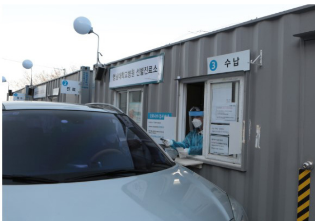
Fig. 4. Payment using a credit card.