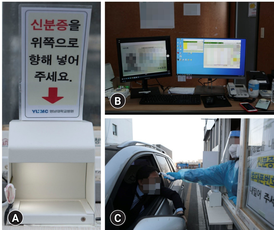
Fig. 2. Step 1. (A) Identification (ID) card scanner (description in Korean: “Please insert the ID card with photo-side up.”). (B) A scanned image of the ID card on a computer monitor. (C) A noncontact forehead thermometer was used to measure an individuals’ body temperature.