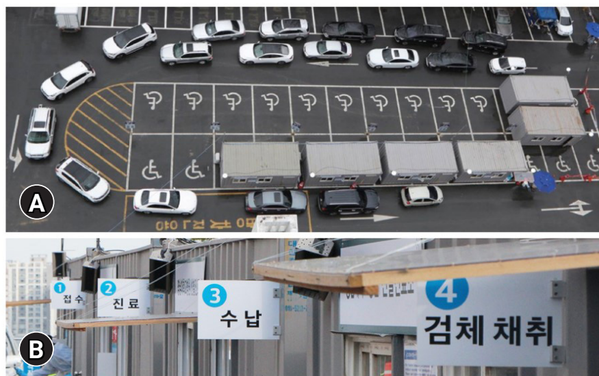
Fig. 1. (A) Aerial photography of the Yeungnam University type drive-through (YU-Thru) system. (B) Four steps of the YU-Thru system; ① registration, ② medical examination, ③ payment, and ④ specimen collection.

First, each person to be tested placed their identification (ID) card into the scanner. Then the ID card was scanned into the computer, as shown in Fig. 2. The YU registration number was automatically created when the staff member entered the patient's date of birth and social security number, as displayed on the computer monitor. For non-nationals, the YU registration number was created using the patient's alien registration card; however, the remainder of the process remained the same. For non-nationals who were not registered in South Korea (e.g., tourists or illegal aliens), the YU registration number was created from passport numbers. The staff then recorded the home address and cell phone number of subjects using the two-way microphone and speaker system. It was important to enter the correct cell phone number into the computer as test results were texted. At the same time, a separate staff member used a noncontact forehead thermometer to measure the subject's temperature. Minor exposure to infected patients may have occurred during this procedure. Although two staff members were recommended overall for step 1, it was possible to complete the registration and temperature testing with one staff member performing