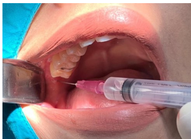
Fig. 1. One milliliter of dexamethasone (4 milligrams) or one milliliter of normal saline injected through the pterygomandibular space immediately before and after surgery.

The sample size calculation was based on parameters obtained from a previous study using the formula with \alpha = 0.05 , \beta = 0.2 . Therefore, this study required a minimum of 26 participants. Considering a 20% compensation for possible loss and withdrawal of cases, the sample size was increased to 31 participants.