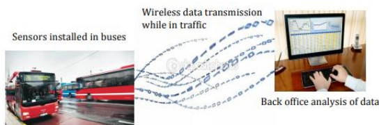
Fig. 2. The overall principle of the RDS

With the rise of ubiquitous computing, the requirements for software have been changing. In particular, As shown in the following Fig .2 are technical problems with the design and implementation of software considering how well the large-scaled ubiquitous software is adapted to a dynamically changing environment[5].