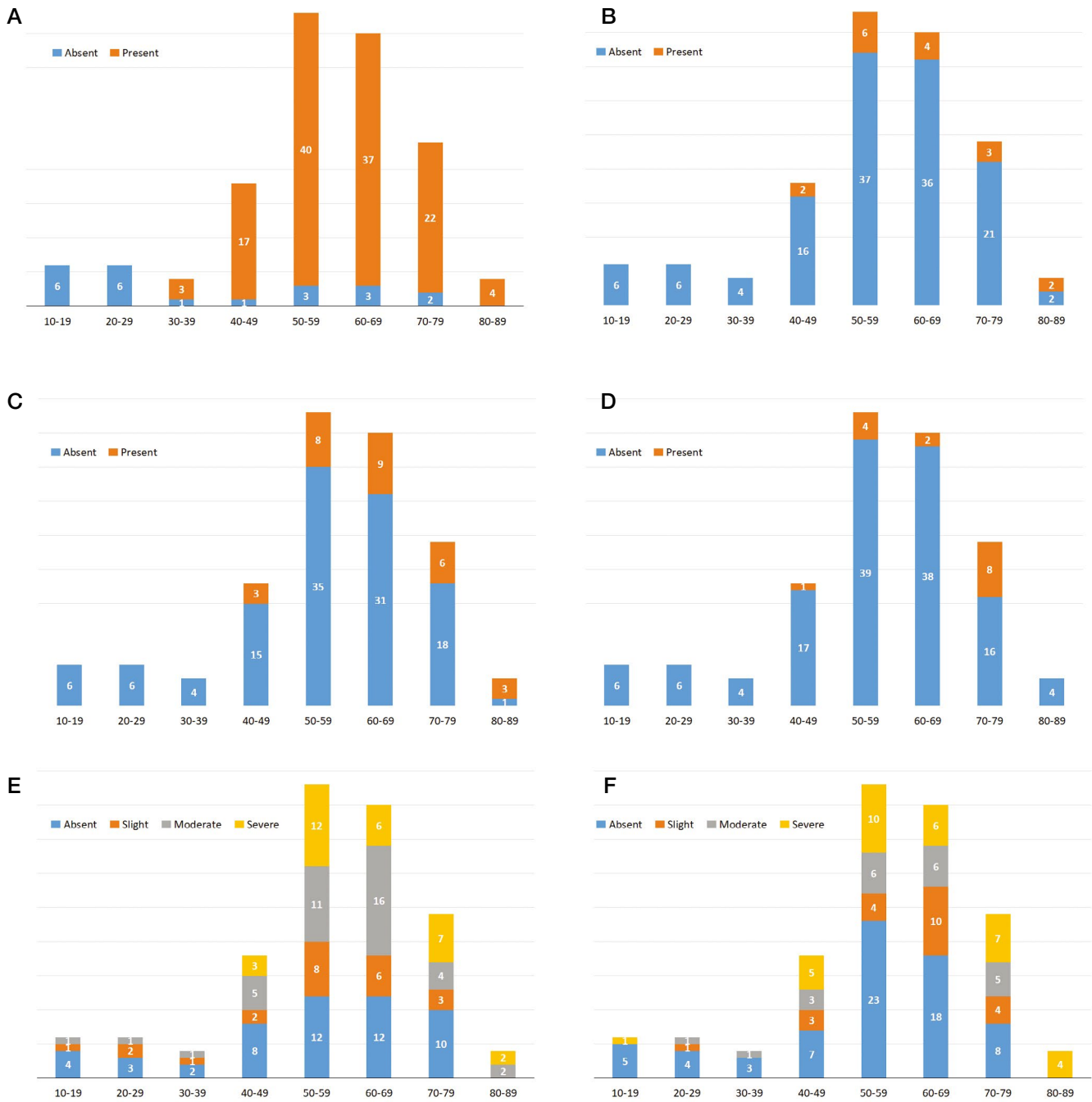
Fig. 2. Age distribution of condylar degeneration on cone-beam computed tomographic images. A. Incidental findings of condylar flattening. B. Incidental findings of condylar resorption. C. Incidental findings of condylar sclerosis. D. Incidental findings of subcondylar cyst. E. Severity of osteophyte formation. F. Severity of condylar erosion.

aged 70-79 years, and 2 patients aged 80-89 years (Fig. 2E). A statistically significant linear association was found between the severity of osteophyte formation and age ( P < 0.05 ), suggesting that the severity of osteophyte formation increases with age. Severe condylar erosion was observed in 5 patients aged 40-49 years, 10 patients aged 50-59 years, 6 patients aged 60-69 years, 7 patients aged