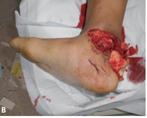
Fig. 2. (A) Operative findings of right femoral artery thrombosis in patient #1. (B) Open calcaneal fracture of the right ankle in patient #1. CFA: common femoral artery, DFA: deep femoral artery, SFA: superficial femoral artery.