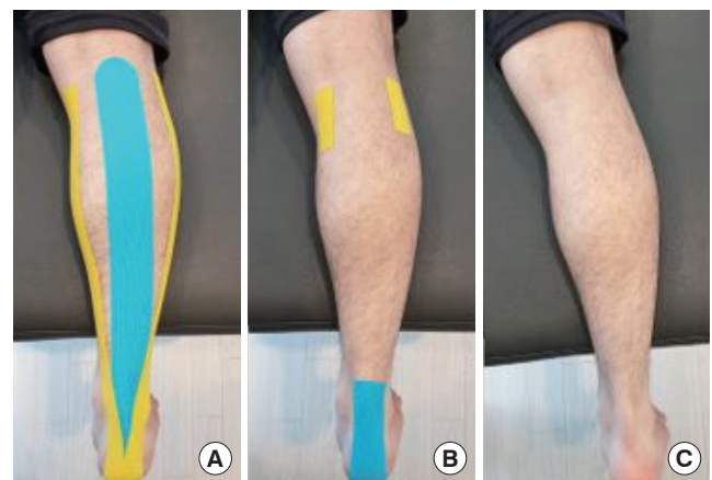
Figure 1. Three different taping conditions. (A): Kinesio taping, (B): Sham taping, (C): No taping.

Measurements of the joint reposition sense error (JRSE) were taken using the 3D motion capture device (Myomotion Research PRO, Noraxon Inc., USA) that uses an inertial measurement unit sensor. To measure the JRSE, motion capture sensor was placed at the center of between 2nd and 3rd metatarsal bone. Subjects were performed passive ankle plantar flexion from staring position (ankle neutral position) to target angle (ankle plantar flexion 20°). Subjects were asked to actively reproduce the target angles and were instructed to 'hold it there' for 5 seconds. The subjects were then asked to say 'now' when they perceived the ankle joint was at target angles.