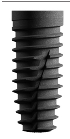
Fig. 1. SNUCONE AF+II® implant.

According to the studies on success rate, the Brånemark system reported maxillary 78% and mandible 86% of success rate for 15~24 years, and other studies for 5-year success rate reported 98% for maxilla and 97% for mandible. In the case of the survey only in the maxilla, the success rate was 94.4% for 5 to 6