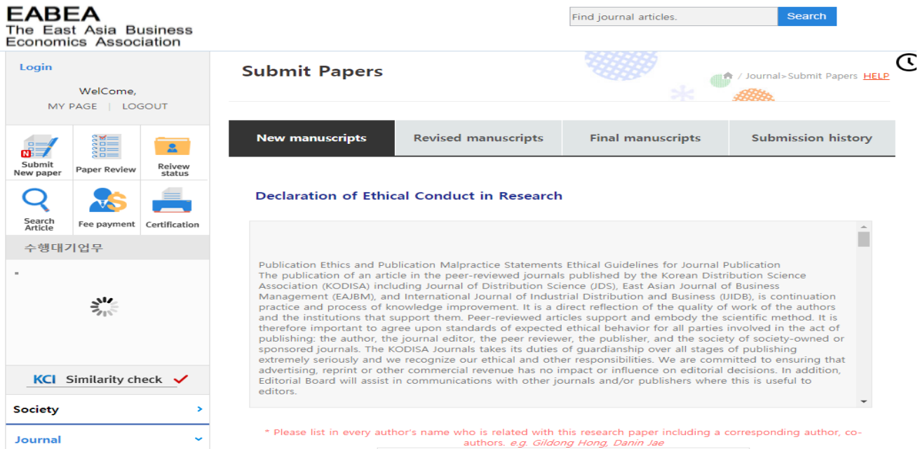
Figure 2: Declaration of Ethical Conduct in Research

On the online JAMS system, the procedure of paper submission and review regulations were clearly presented, and all the paper of contribution is received through the online JAMS system, and the feedback related to review is carried out quickly.