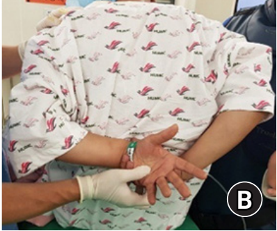
Fig. 4. (A, B) The patient was instructed to initiate passive exercise programs right after manipulation under anesthesia to maintain the restored range of motion, in which forward elevation and the backside arm-curl maneuver were emphasized.