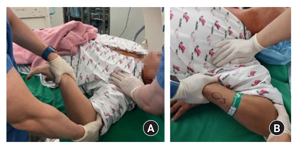
Fig. 1. (A) Internal rotation with the arm at 90° abduction, with the assistant pushing the shoulder girdle downward toward the floor was performed to complete the posterior and inferior capsule tear. (B) With 90° abduction with full internal rotation, further abduction can result in further capsular release with an audible sound.

In group B, manipulation preceded arthroscopic procedures and was performed at forward elevation only for the safe release of the inferior capsular area after interscalene plexus block and