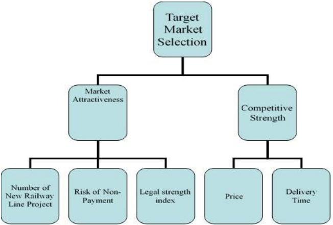
Figure 4: AHP Hierarchical Structure Model

The AHP structure follows the decision of goal and the criterion. Figure 4 shows the AHP structure.