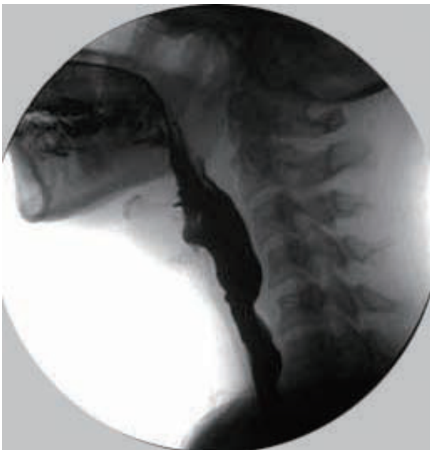
Fig. 3. Thin barium swallow: no spillage or extravasation of the dye can be seen.

The patient was observed in the intensive care unit for a day, feeding via gastrostomy was started on the second day, and sutures were removed on the seventh day. We gave him sips of water on the ninth day, and except for some mild coughing, he had no problem with swallowing and he could increase his liquid intake on the 10th day. A thin barium swallow was done on the 11th day, and likewise did not show any leaks or extravasation of dye (Fig. 3). On the 12th day, we performed a flexible laryngoscopy; except for some edema, the wound had healed well and both vocal cords were mobile. Based on these encouraging observations, we transitioned the patient to oral feeding with a soft diet and removed the tracheostomy on the 14th day. After tracheostomy removal, he could speak normally. The gastrostomy tube was kept and removed at the next outpatient department visit. The patient and his family members were counseled regularly, and at a 6-month follow-up visit, he was doing well and free from alcoholism.