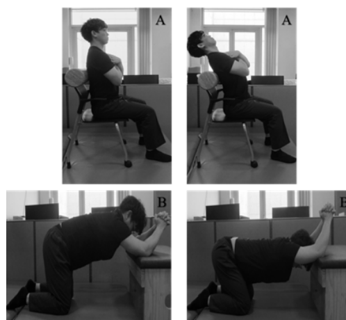
Fig. 2. Application of TFE (A: seated thoracic extension with foam roller, B: kneeling thoracic extension exercise)

were as follows [18]: the participant knelt in front of the bench, faced the box, and placed their elbows on the bench shoulder-width apart, with hands interdigitated; the participant then pushed their hips back on their heels and simultaneously pressed their chest towards the ground to make a thoracic extension. The aim was to stretch their ribs towards the ground as far as possible. They maintained this position for 10 seconds, returned to the starting position and rested for 20 seconds before repeating the procedure 10 times.